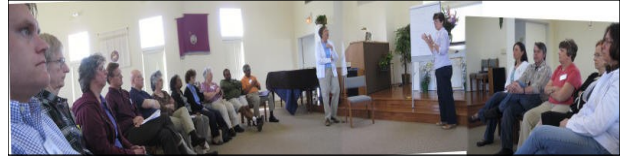
UPB Church Leadership Retreat

United Parish of Bowie - 2515 Mitchellville Road, Bowie 20716 www.unitedparishbowie.org - upbannounce@gmail.com - 301-249-6411