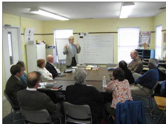
Adult Christian Education Class