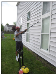
Clean Up Day

Thank you to everyone who has given of their time and talents! You are what make our church so wonderful.