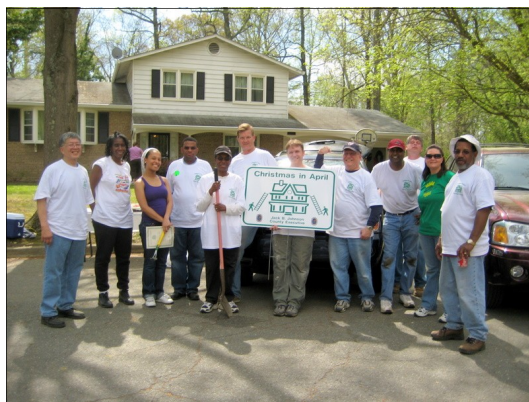
Christmas in April Service Project

Each month we continue to provide a Sunday meal for the Safe Passage home of the Family Crisis Center. I saw several grateful mothers and