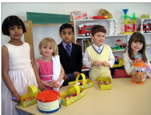
The Four Year Old's Class

Sundays of July and August, the children will be invited to attend a special activity time, but the rest of