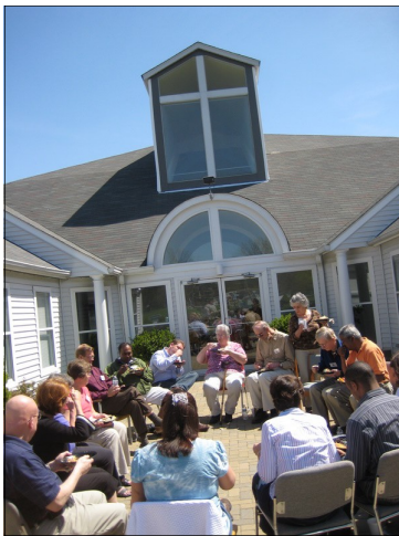
Lunch on the UPB Patio

We have had a great year of UPB Fellowship!