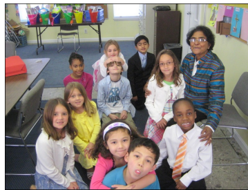
Sunday School Class

4. Mission Project: The children took part in an exciting mission project this year. The mission was to provide financial support to ,collect funds for "Living Waters for the World (LWW)" to bring clean drinking water for the children of Haiti. Initially fund-raising for LWW was exclusively by Sunday school children. After a couple of months, we invited the congregation to help the children in their efforts to raise the funds. And, the response has been very good. LWW is an organization affiliated with the Presbyterian Church (USA) and is committed to providing clean drinking water to all God's children in poor and developing countries all