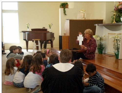
Children's Sermon during Worship

And so much more! Thank you for everything you do.