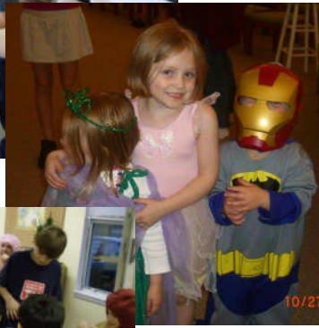
Seeds of Worship