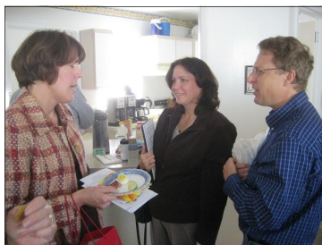
Enjoying Chat & Chew

Men's Breakfast: A gathering of UPB Men the 1st and 3rd Tues. of the month at 7:30am at Bowie Bob Evans.