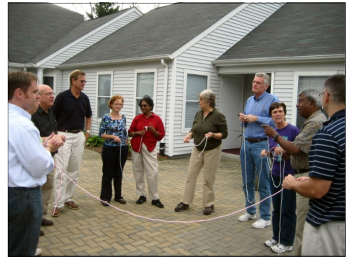
The Fall 2009 Leadership Retreat

Right now we have lots of committed people engaged in wonderful hands on ministry. But we don't have many places where long range planning, discernment, visioning, goal setting and evaluation are going on. As we brainstormed possibilities the idea emerged that we could have committees exist to discern God's lead for specific areas of the church, to pray, to vision, to evaluate, and to facilitate communication and connection between the teams that are actually doing the hands-on ministry (what we now call committees). If you'd like to be involved in this exciting process, please give me a call or send me an email! Thanks!