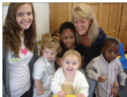
The UPB Nursery Kids

The UPB babies and young children have had a wonderful fall season. Children love the bright room, variety of toys, and fantastic nursery team.