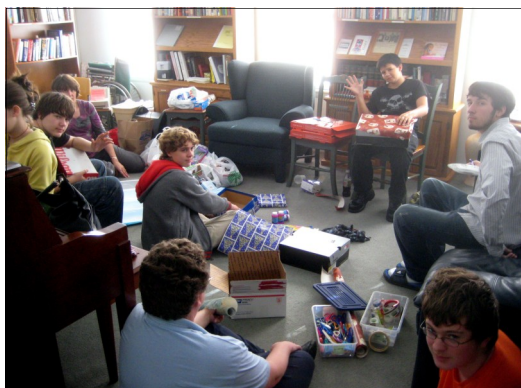
UPB Youth Fall Service Project

Our youth group, with students in 6th to 12th grade, meets after worship the 1st and 3rd Sundays of