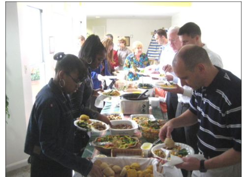
The Consecration Sunday Feast

Thank you to everyone who gives their time and talents in making UPB a wonderful place to be. Whether you serve in leadership, sing in the choir, teach adult ed or Sunday School, work behind the scenes, or pray for the ministries, you are appreciated!