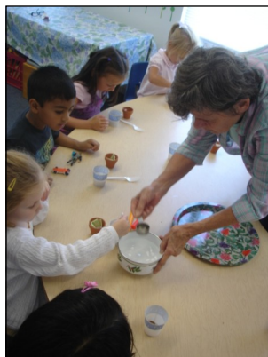
Younger Kids Sunday School - Planting Seeds