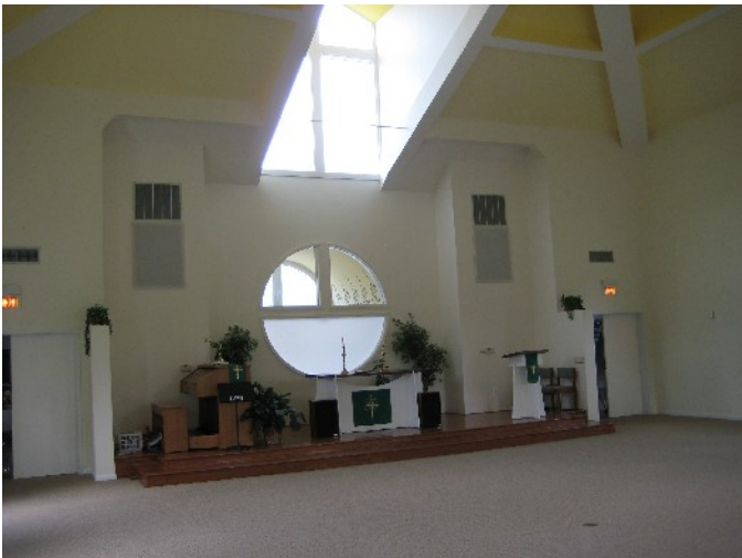
Altar area now refinished in wood.