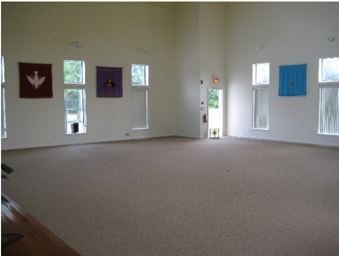
New Carpet in a freshly painted Sanctuary