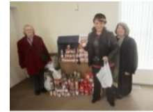
SOUPER BOWL OF CARING PAGE 7