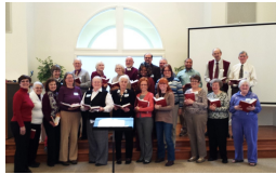
HYMNFEST PAGE 2