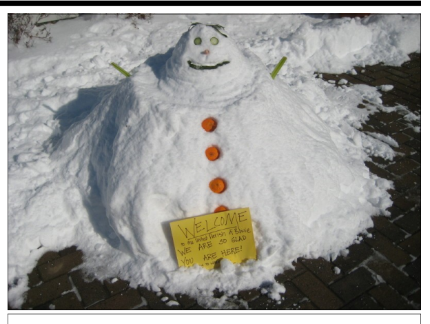
The UPB Welcome Snowman