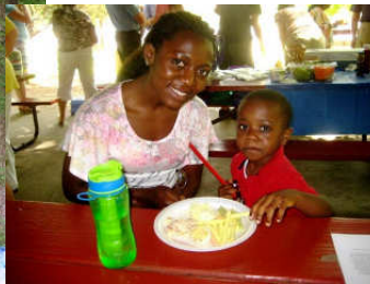
Worship and Picnic in the Park