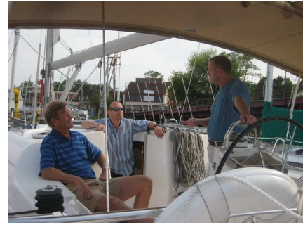
An extra special Men's Night Out

Special thanks to all who participated in and helped with our summer programs and events. Thank you to all who helped make our youth mission a huge success. Whether it was attending a Baysox game and building UPB friendships, helping with Operation backpack and serving the local community, or participating in a worship service and growing in faith, it was an amazing summer!